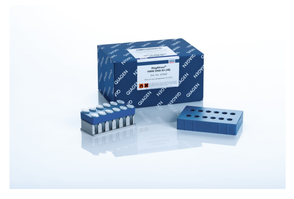
Figure 2. Convenient parallel processing of up to 12 samples with the MagAttract Magnetic Rack. The MagAttract Magnetic Rack has a removable tube holder that fits onto the Eppendorf Thermomixer or common microtiter plate mixers using the included adapter plate. The MagAttract Magnetic Rack renders unnecessary the tedious processing of individual tubes.

The MagAttract Magnetic Rack consists of 3 separate components: a tube holder, a magnetic base and an adapter plate (Figure 2). The MagAttract Magnetic Rack is designed for the handling of up to 12 samples in parallel, in 2 ml reaction tubes. The magnetic-bead-based purification is performed on a standard laboratory shaker (e.g., Eppendorf Thermomixer) suited for the shaking of reaction tubes, as well as microtiter plates in SBS format. The tube holder of the MagAttract Magnetic Rack is fixed onto the shaker by the SBS adapter plate.